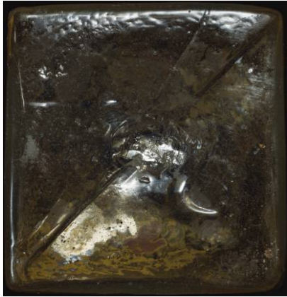
Fig. 6 Detail, base of flask, 1725–50. India or Europe. Gold, glass, enamel; 2\frac{1}{2} \times 2\frac{3}{8} in. (6.3 × 6.1 cm). Collection of the Corning Museum of Glass, Corning, NY, 2002.1.1a.

independent, are linked by a number of consistent features: an angular base, flat sides, and gilded ornament, as well as the method of manufacture, having been made using triangular molds. The joints at the two corners where the mold segments were fused are invisible under layers of gilding, although the corresponding diagonal seam appears prominently on the base, punctuated by a pontil mark (fig. 6). These shared characteristics tie together a whole group of vessels of various sizes (ranging from two to seven inches in height 5 ), glass colors (colorless, blue, yellow, green, and purple), shapes (square- or oblong-sided), and decorative programs (figural or floral) that can be found across museum collections in Europe, the United States, the Middle East, and Asia (see fig. 7).