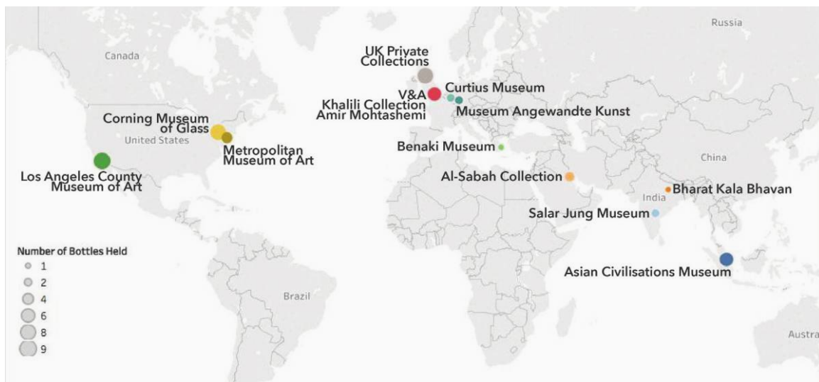
Fig. 7 Locations of fifty-six Indian glass bottles in global museums and private collections. The size of the icons shows how many bottles can be found at each site. Created by Nancy Um using Tableau and Adobe Illustration, 2018.

In this article, I propose that the significance of these glass bottles hinges upon their boxed presentation, even if most are no longer associated with their