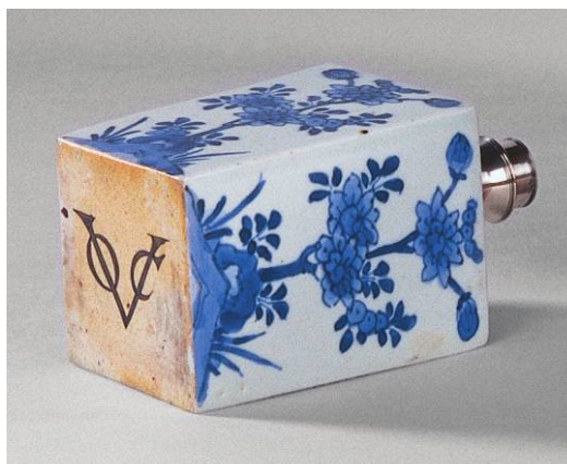
Fig. 11 Detail, bottle with VOC insignia on the base, ca. 1680–1700. Japan. Underglaze painted porcelain, silver; base: 2\frac{3}{4} \times 2\frac{3}{4} in. (7 cm × 7 cm). Rijksmuseum, Amsterdam, NG-444. Image in the public domain.

offer an extraordinary amount of detail in regard to the boxes' specifications. Four were to be made of sandalwood, using pieces that had been sent over to Japan expressly for that purpose. Of the four sandalwood boxes, two were to hold nine bottles and the other two were to hold six. They also specified that two of the sandalwood boxes were to be provided with silver fittings and the other two with brass ones. The remaining two boxes were to be made of camphorwood with brass fittings, outfitted for nine bottles of twelve ounces each. In regard to the bottles, they were to be crafted of porcelain at nearby Arita in two sizes, with twelve- or sixteen-ounce capacities, based on wooden models provided by a