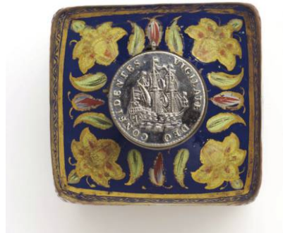
Fig. 9 (right) Dutch coin bottle cap, 18th century. India. Glass with polychrome gilt decoration; 5½ × 2⅝ in. (14 × 6.5 cm). V&A Museum, 15-1867.

established in Bhuj in the middle of the eighteenth century. This intriguing yet unverifiable connection would extend the date of the bottles decades later. 13