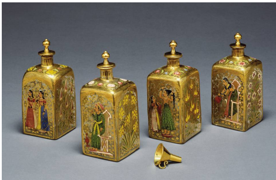
Fig. 2 Four flasks with fun- nel, 1725–50. India or Europe. Brass, gold, glass, enamel; flask height: around 5¼ in. (12.8 cm). Collection of the Corning Museum of Glass, Corning, NY, 2002.1.1.