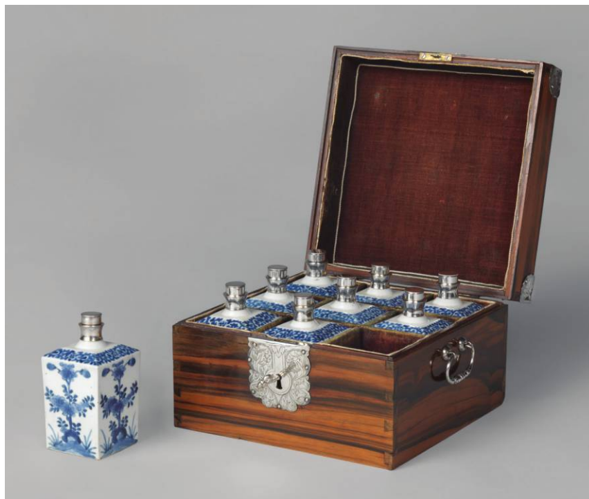
Fig. 10 Case with nine bottles, ca. 1680–1700. Batavia (box) and Japan (bottles). Calamander wood, underglaze painted porcelain, silver, velvet; box: 10\frac{1}{8} \times 10\frac{1}{8} \times 6\frac{1}{2} in. (27 × 25.5 × 16.5 cm); bottle height, with cap: 6 in. (15 cm). Rijksmuseum, Amsterdam, NG-444. Image in the public domain.