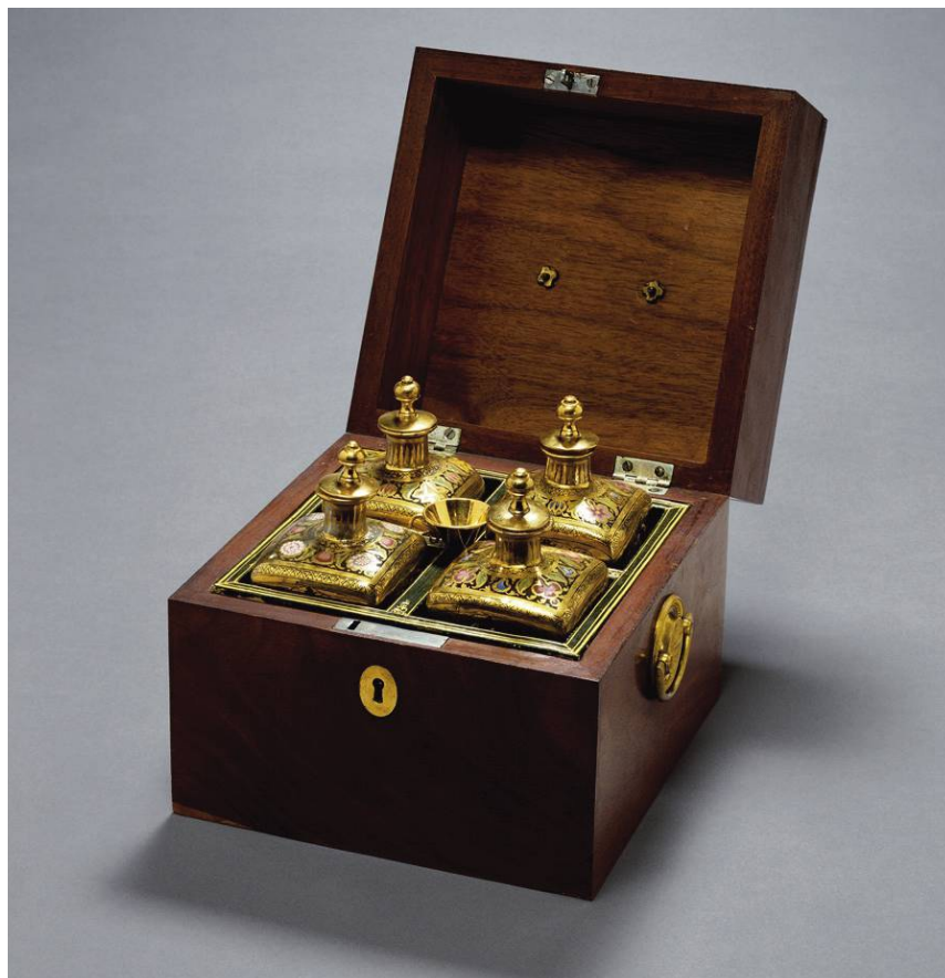
Fig. 1 Four flasks with funnel in wooden box, 1725–50. India or Europe. Wood, brass, gold, glass, enamel; box: 7½ × 7½ × 6¼ in. (19 × 19 × 17.2 cm). Collection of the Corning Museum of Glass, Corning, NY, 2002.1.1.