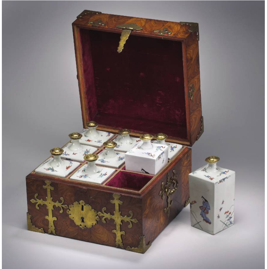
Fig. 12 Set of nine bottles in a mounted casket, late 17th century. Japan and Germany or France (bottles) and Europe (casket). Wood, porcelain; box: 10\frac{1}{2} \times 14\frac{1}{2} \times 14\frac{1}{4} in. ( 26.7 \times 36.8 \times 36.8 cm). Peabody Essex Museum, Museum Purchase, 2001, AE85952.A-J.

merchant named Sweers. They also asked that the porcelain be the “whitest and finest” with the “most beautiful blue painting and with silver caps.” The VOC merchants of Deshima were unable to fulfill this order during that season, so the items arrived in Batavia near the end of the following year. Ultimately, they complied with only some of the very exacting provisions of the commission, returning six boxes made only of sandalwood, four with silver fittings and the other two with brass ones, along with one hundred matching bottles of a single, yet unspecified, size. 29