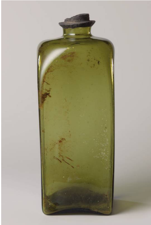
Fig. 8 (left) Square bottle, ca. 1650–1700. Northwestern Europe. Yellow-green glass, tin; 10¾ × 4¼ in. (27.3 × 10.5 cm). Rijksmuseum, Amsterdam, BK-KOG-1709-C.